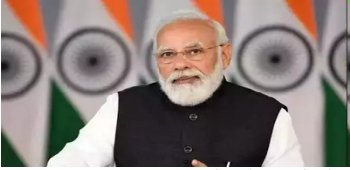
AHMEDABAD: Prime Minister Narendra Modi will inaugurate the mega milk powder plant and other projects of Sabarkantha District Co-operative Milk