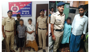
Various photos of RPF personnel reuniting children with their families across Western Railway.